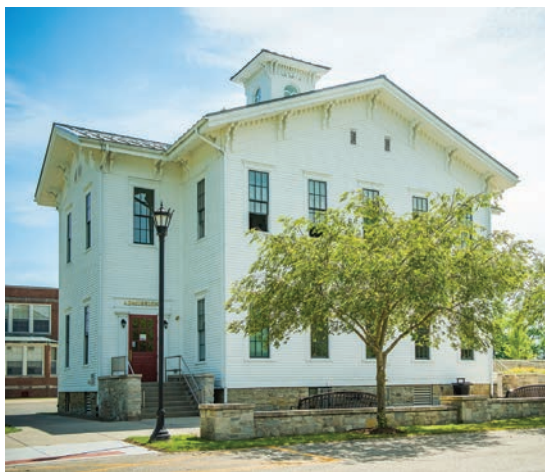
Undergraduate Admissions Office – Academy Hall

F From Philadelphia, Pennsylvania, Area (approx. 6.5 hours) Travel west on Interstate 76 (Pa. Turnpike) to Interstate 79. Proceed north on I-79 to the Edinboro exit (#166).