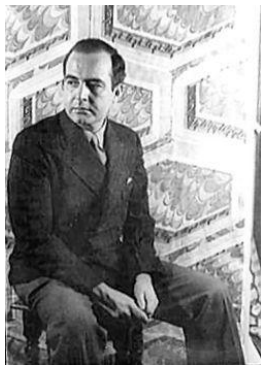
Samuel Barber b. West Chester, PA, 1910