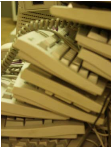
A stack of outdated keyboards await recycling in Ross Hall.

Since September of 2004, Edinboro University has recycled 1132 pieces of technology equipment.